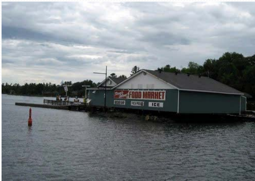
Picnic Island 2011